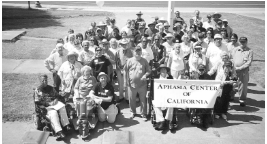
Inside: ACC's 2006 Walk to Talk