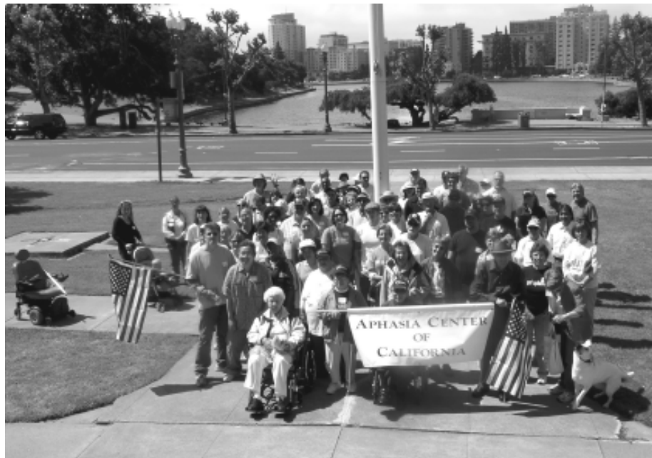
The 2007 Walk to Talk participants gathered at Lake Merritt