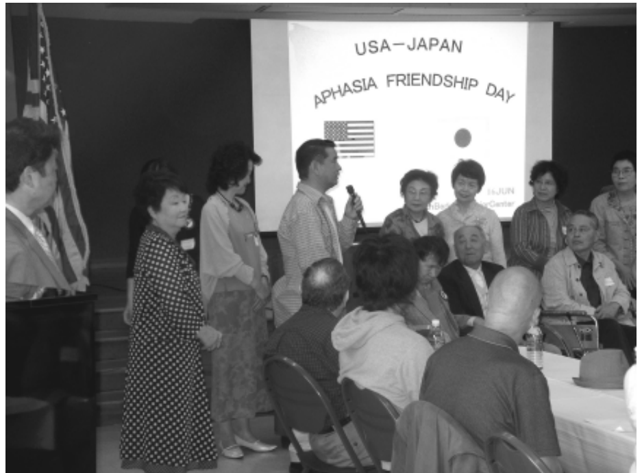
Visitors from Japan introduce themselves

Laughter and conversation highlighted the event. The room was filled with 16 tables—each had stroke survivors and family members from Japan, stroke survivors and family members from the Aphasia Center of California, and a Japanese student studying English in San Francisco, who