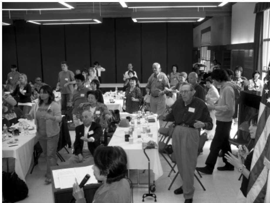
Above: Participants try various Tai Chi movements. Below: the entire group gathers for a Friendship Day group photo.