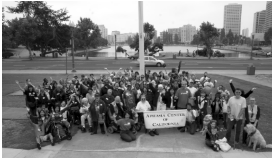
2008 Walk to Talk at Lake Merritt.

Please join us in publicly thanking the following companies that donated services or merchandise for our participant prize drawing. We